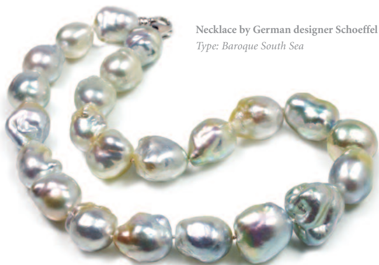
Necklace by German designer Schoeffel Type: Baroque South Sea

No matter the color you choose, it should be rich and evenly distributed. Dell’Arciprete recommends viewing the pearls on a white background and, the final test, to hold the pearls against your skin to see if they agree with your skin tone. White and pink rose tend to flatter the widest range of complexion colors.