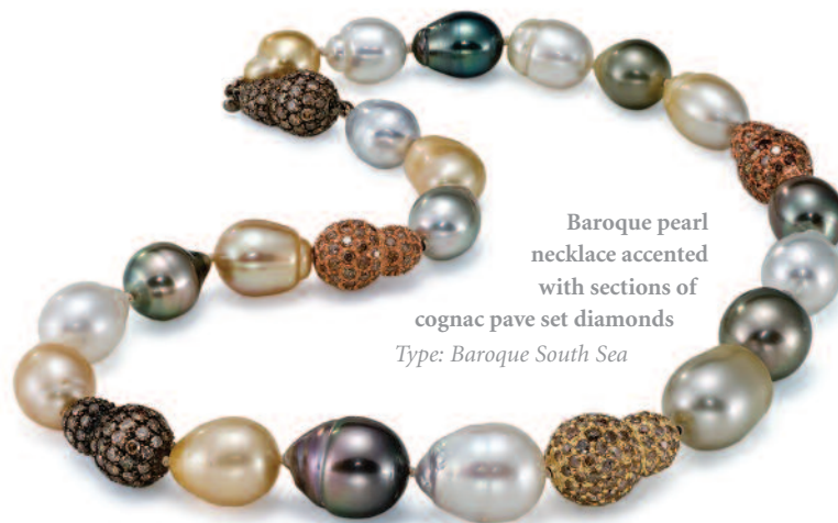
Baroque pearl necklace accented with sections of cognac pave set diamonds Type: Baroque South Sea

“Put your thumbs together, forefingers in front of you, making a window, take the strand where your thumbs are and roll it backward to the end of your hand,” Maffeo explains. “Do you see little bumps as