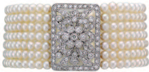
Seven strand cultured freshwater pearl bracelet with antique-style diamond clasp Type: Freshwater

wear big gaudy necklaces, the trend is to wear something understated. Pearls fit into this understated quality category of jewelry.”