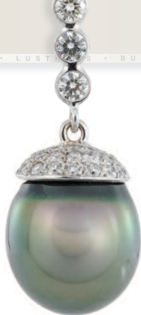
Bezel set diamond strand leading to a Tahitian South Sea pearl with a diamond pave top Type: Tahitian South Sea

As its creation is in nature's hands, it stands to reason that a pearl would be a rarity, if not an oddity. During its formation, the battle with the irritant might end in the oyster's demise. Or the pearl might become worthless due to outer influences like tides and disease. With nature in charge and price reflecting this, pearls were desired by many, but purchased by few.