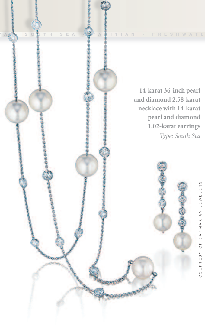
14-karat 36-inch pearl and diamond 2.58-karat necklace with 14-karat pearl and diamond 1.02-karat earrings Type: South Sea

The most popular pearl and a perfect choice for all occasions is the Akoya, according to Mark Dell’Arciprete, manager at Natick’s Ross-