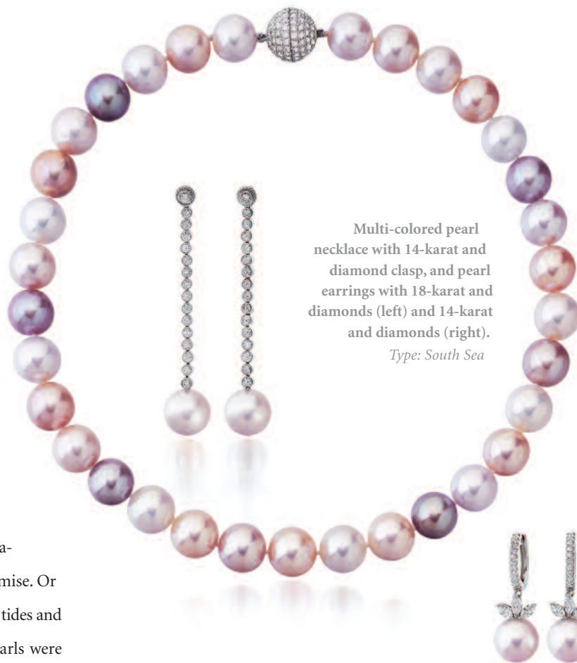
Multi-colored pearl necklace with 14-karat and diamond clasp, and pearl earrings with 18-karat and diamonds (left) and 14-karat and diamonds (right). Type: South Sea

The help he brought was in developing the method of culturing pearls. "I would like to adorn the necks of all the women of the world with pearls," Mikimoto said shortly after he succeeded in culturing a perfectly round pearl in 1905, 12 years after his first successful semi-circular pearl. Today, most pearls are cultured.