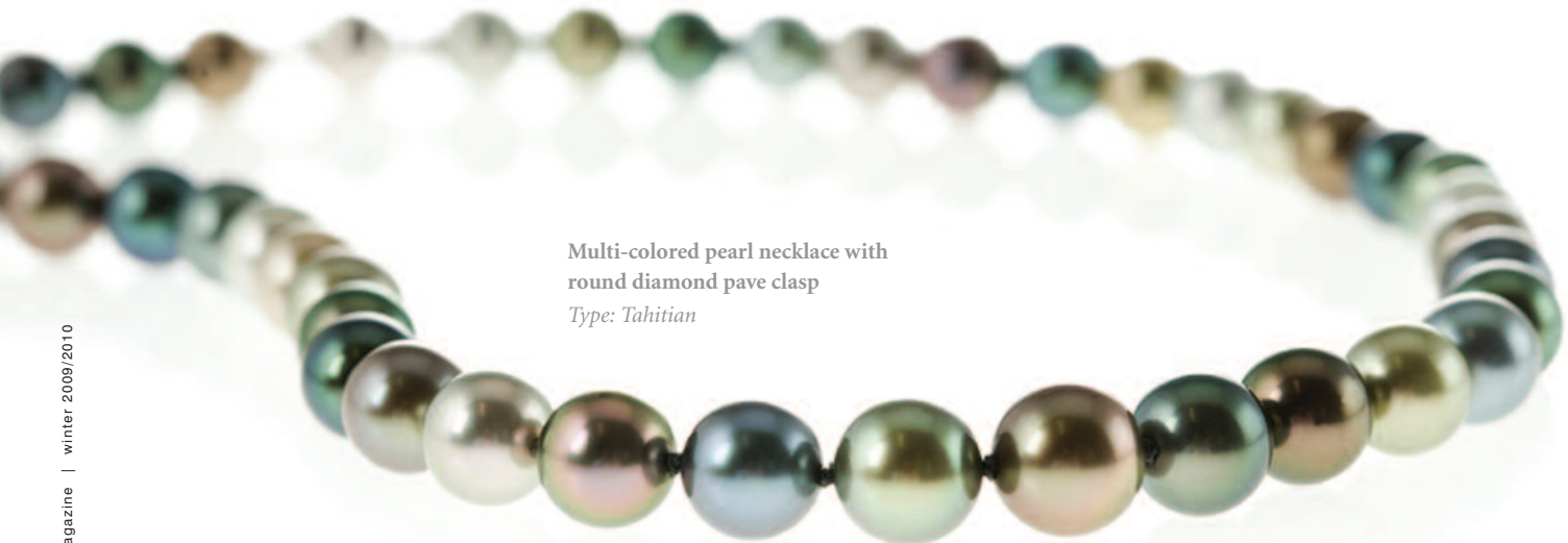
Multi-colored pearl necklace with round diamond pave clasp Type: Tahitian

Simons. Primarily harvested from chilly Japanese waters, these pearls range in size from three millimeters to ten millimeters and are known for their luster and rich color—white or cream with overtones in rose, silver, or cream.