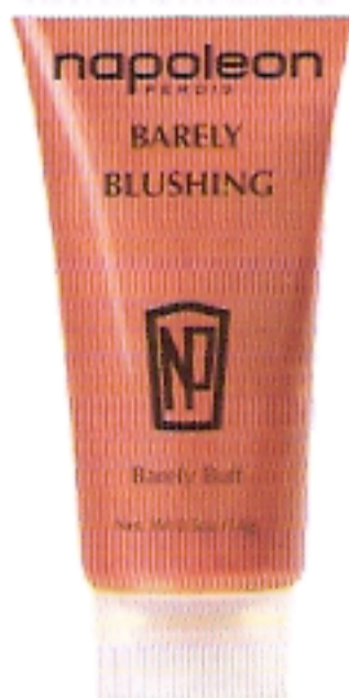
Napoleon Perdis, Barely Blushing, $19, at Sephora