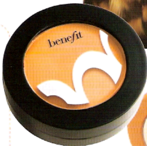
Benefit, Silky Powder Eye Shadow in Soft Shoulder, $18, visit benefitcosmetics.com

A fresh face is the perfect canvas for feminine pinks, beautiful greens or plum hues. Begin with a highlighting color on the brow bone and on the inside corner of the eye. Then lightly brush a very neutral but slightly darker shade into the crease of the eye. Work an accenting eyeliner into the base of the lashes, brush on a few sweeps of mascara and add a neutral lip color—you're ready for a mimosa.