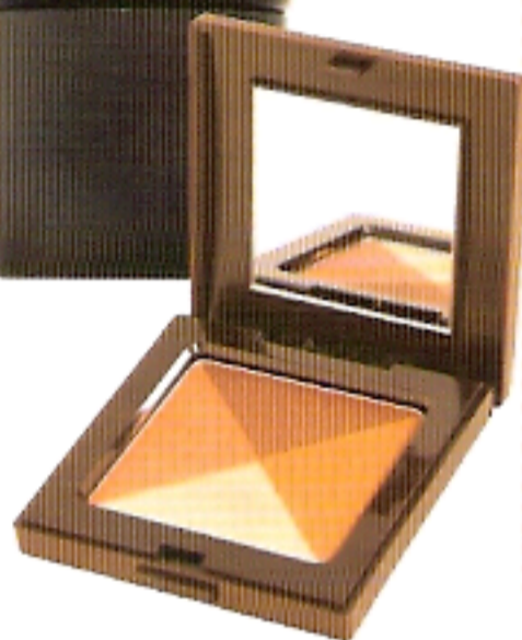
Laura Mercier, Shimmer Block in Golden Mosaic, $38, at Saks Fifth Avenue