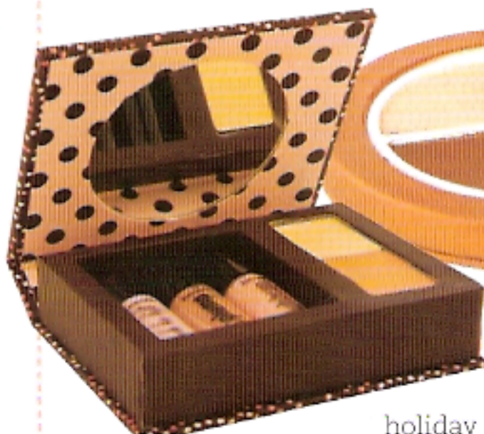
Benefit, Realness of Concealness, $28, at Sephora