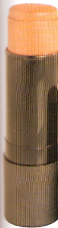
NARS, The Multiple in South Beach, $36.50, at Bloomingdale's