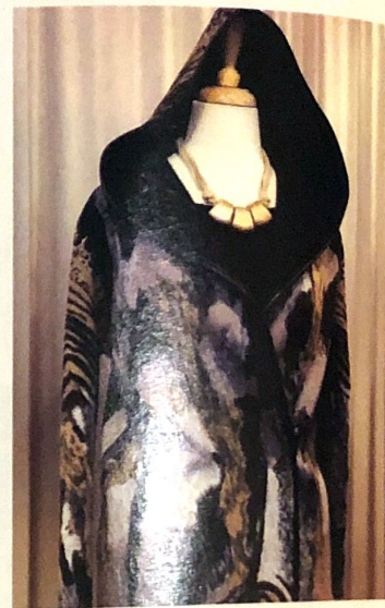
UNUSUAL ANIMAL PRINTS Denise Hajjar Boutique at Setting the Space, 490 Assembly Row, Somerville