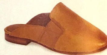
LOAFER MULES Frye, 284 Newbury St., Boston