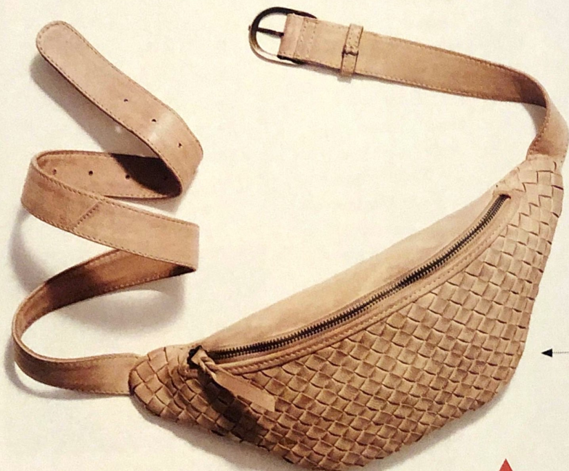
▲ Free People's Cut n Paste woven cross-body belt bag. $158, available at freepeople.com

AS THE CYCLICAL NATURE of the fashion world dictates, what comes around goes around. And, as the Spring/Summer 2019 style season demonstrates, sometimes it goes around your waist.