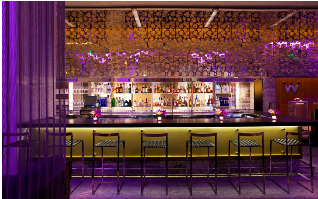
Cosy up on a couch for a fireside cocktail at the swanky W Boston lounge

Top Sites: With Boston holding court as a walking city, it isn't hard to get around its top sites with or without wheels. Hit most of history's hot spots by following the famous Freedom Trail , a DIY 2.5-mile, brick-lined route through Boston that takes a page out of America's past with 16 historically significant stops, such as Granary Burial Ground, Kings' Chapel Cemetery, the Old State House and the Boston Massacre Site. It also goes right by the USS Constitution, or "Old Ironsides." A true symbol of Boston's seaside status, this is U.S. Navy's oldest commissioned warship afloat in the world, and you can explore its decks on a guided tour. Miss a visit and tour to Fenway Park , America's most beloved baseball park and home of the Red Sox, and you've struck out.