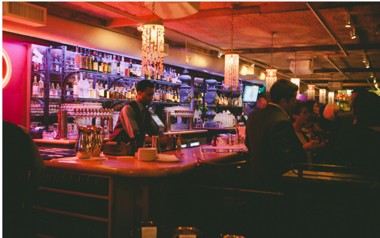
Located in Harvard Square, Beat Brasserie is an artsy spot to grab a cocktail and listen to local live music

Where to Break Curfew: When meetings have wrapped, you deserve a little fun. Head over to the South End's shaggy chic Beehive or its sister restaurant in Cambridge's Harvard Square, Beat Brasserie , for live music, psychedelic art, and funky fare. Or kick it old school and relax at Wally's Café , a tiny jazz and blues hideaway. For fast and furious release, step into the bustling Jillian's Pool Hall to play on their 24 tournament calibre pool tables, six bowling lanes and 12 plasma screens.