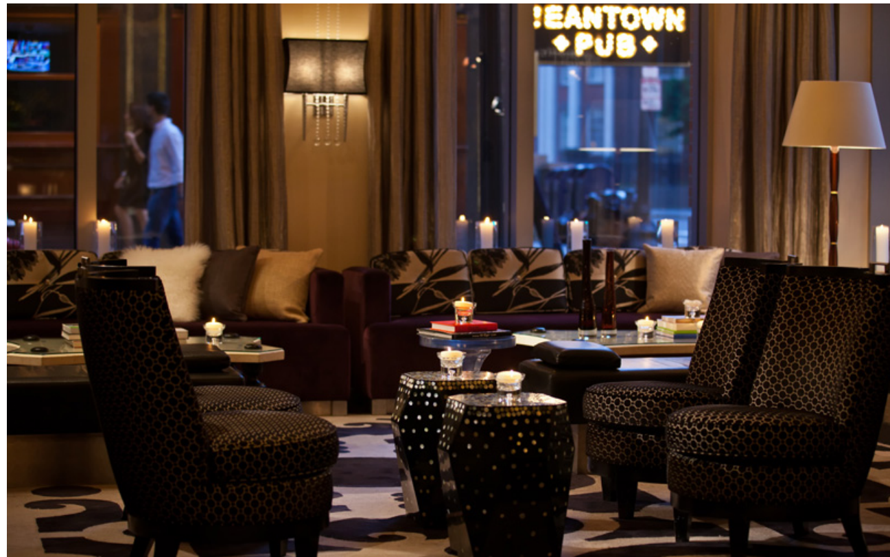
The Living Room Lounge at Nine Zero adds a vintage vibe to this Kimpton Hotel in Boston's Back Bay

Where to stay: Where you stay in Boston is as important as what you do while you're there. Nobody plays the chic boutique hotel hand better than a Kimpton hotel, and its Nine Zero is no different. This hotel blasts you out of the standard overnight experience with its vintage cocktail lounge, colourful modern décor, and even a "floating" suite that uses futuristic retinal scans.