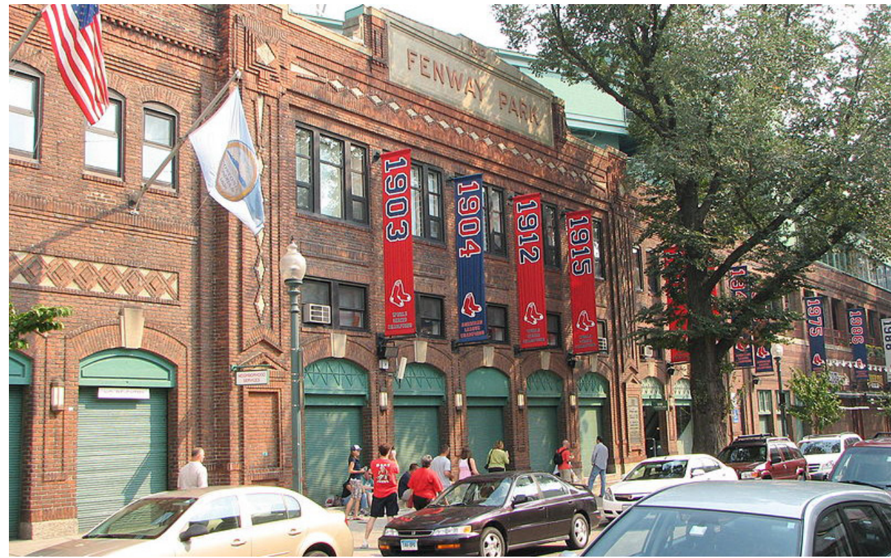
Daily tours are offered through Fenway Park, known by many as America's beloved ballpark

Great Gifts: There's nothing like bringing home something special for someone special to commemorate your time away. When you're in need of a little local flare, a visit to Quincy Market is a must. Home to the country's first pushcart, the cobblestones of this 6.5 acre outdoor marketplace weave you from cart to cart decked in Boston garb. For more notable names (think Valentino, Max Mara and Ted Baker), hit up Newbury Street, the "Rodeo Drive of the East".