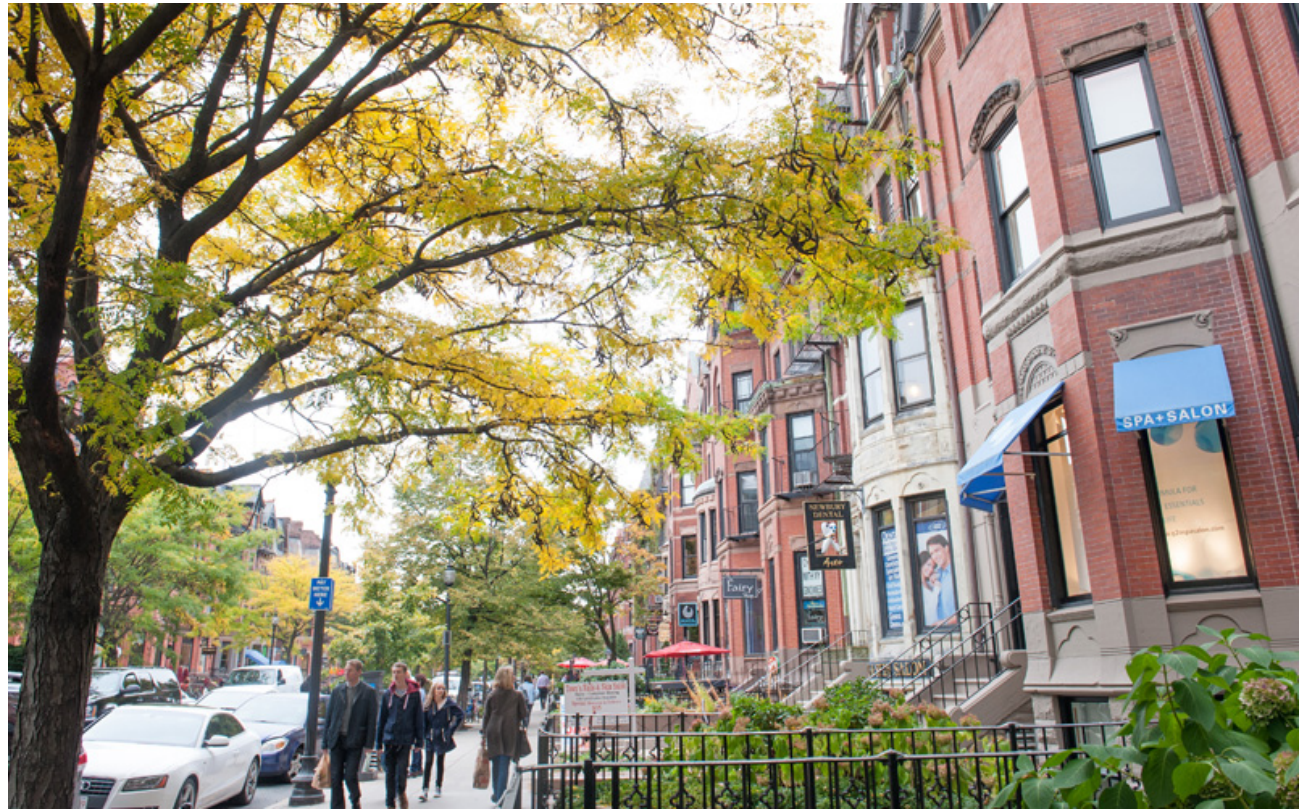
Stroll the high-end designer shops of Newbury Street, an eight-block stretch known as the Rodeo Drive of the East

Going Local: When locals want to get outside and play, they grab their sneakers and hit the pavement for a run along the Charles River, which runs between Cambridge and Boston. There's also the Rose F. Kennedy Greenway. Once the home of the main highway, it's now a peaceful outdoor setting with fountains, a carousel, and benches for sunny day appreciation. Or check out the Emerald Necklace, a vibrant park system consisting of six parks, the Arnold Arboretum and Jamaica Pond. If you work up a thirst, blend hops with history during a tour of one of Sam Adams , Boston's most beloved brewery.