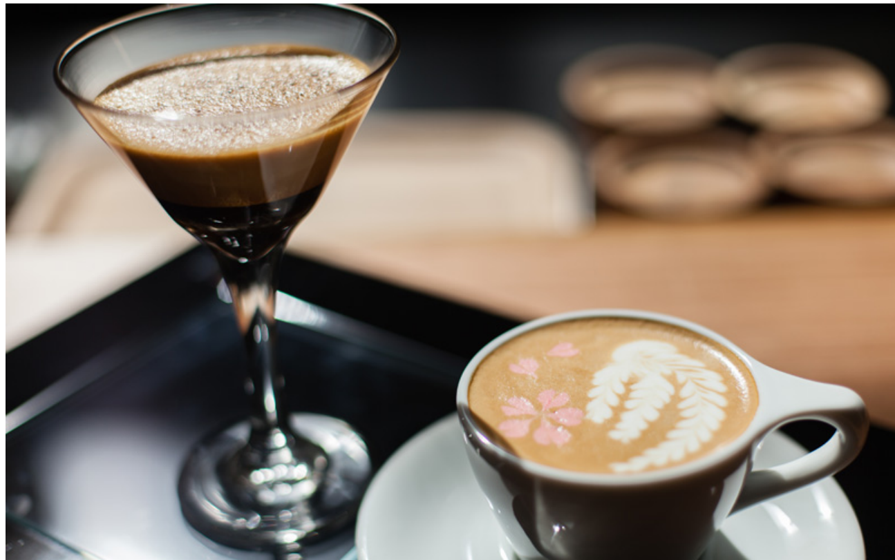
Wake up with Ogawa a's signature chilled foamed espresso in a martini glass or an ornate cappuccino

Where to eat: Pump up your morning with hot java from Ogawa Coffee. This is the Japanese coffee shop's first U.S. location, and if you're lucky, your cappuccino will be adorned by Haruna Murayama, the 2010 World Latte Art Champion. Later in the day, fill up on traditional New England fare (think lobsters and fried clams) under the iconic red striped awning of the lively waterfront Barking Crab . Or simply eat your way through the North End, Boston's famous Italian District. It might only be 0.36 square miles but its winding streets are packed with cafes, grocery stores and restaurants. While there are plenty of steakhouses in Boston, Strip by Strega has some of the best cuts, along with a glam dining room and tunes spun by the most amazing DJs in town. The handsome French-inspired bistro Bar Boulud brings charcuterie to the next level, along with seasonal New England dishes, pâtés, terrines, and its famous Coq au Vin.