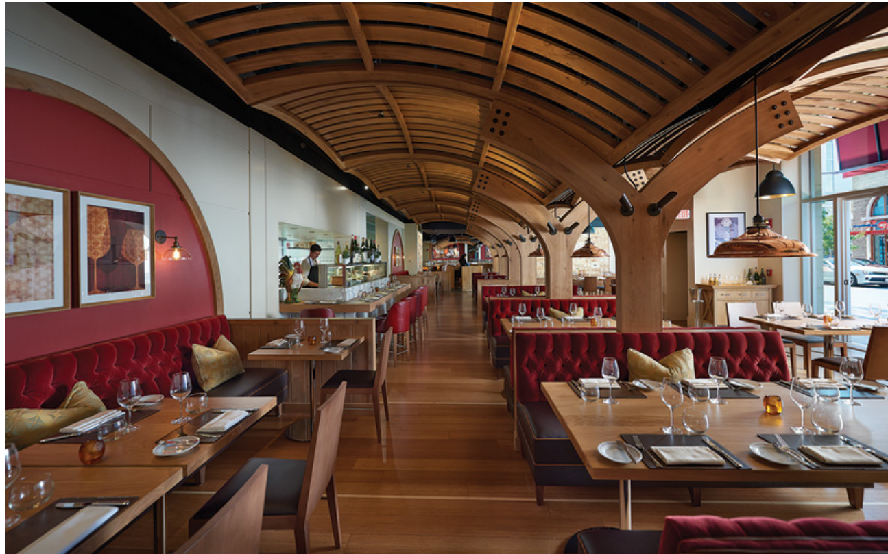
Bar Boulud, a French-inspired bistro inside the Mandarin Oriental Hotel, offers signature charcuterie, pates, and terrines

Where to go for evening cocktails: Gauzy swags, shimmery pillows, globally infused tunes, the swanky W Boston's lounge sets a scintillating scene for sipping cocktails among the city's trendsetters. Or try your hobnobbing skills at the upscale Oak Long Bar + Kitchen , a Back Bay brasserie that offers classic handcrafted cocktails. For a suds selection like no other, visit the Tip Tap Room for its immense list of beers on tap and craft bourbons.